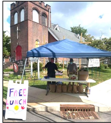
Lunches given out today [Wednesday, July 22] at 11:30 am! We thank our church partner Prince of Peace Lutheran Church for partnering with us

Blessings and thanks, The Social Outreach Ministry Team