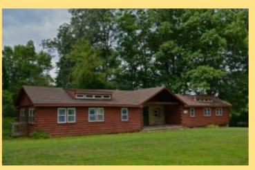
LOG CABIN $75/night