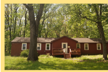
BEISLER CENTER $90/night

EACH RENTAL INCLUDES ACCESS TO A FIRE RING, FIRE WOOD, AND A PICNIC TABLE