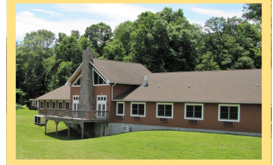
CHRIST CENTER $50/night