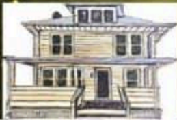
The House Next Door 173 Princeton-Hightstown Road Princeton Junction, NJ 08550