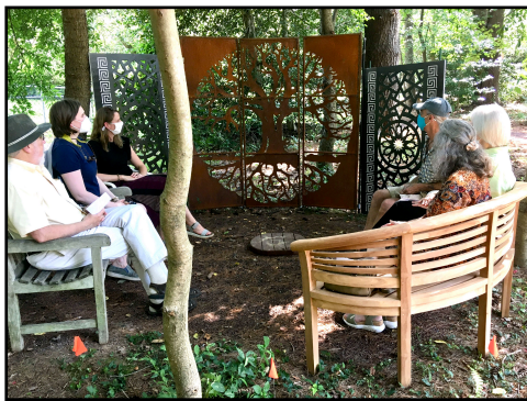
Come and See: At the latest meeting for the Tree of Life Chapel, the team started to see its design come to life!

Led by the Holy Spirit, a committee formed to build a memorial garden specifically for pregnancy and infant loss. Please read the August newsletter to learn more about this ministry and consider joining this holy work in one of the following ways