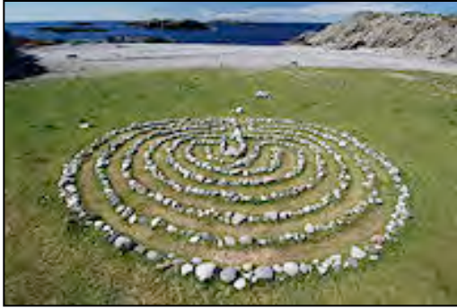
A classic seven-circuit labyrinth at Columba's Bay, Iona Scotland. Walking a labyrinth is an ancient contemplative practice performed by both Christians and non-Christians.

Spiritual direction helps us learn how to live in peace, with compassion, promoting justice, as humble servants of that which lies beyond all names.