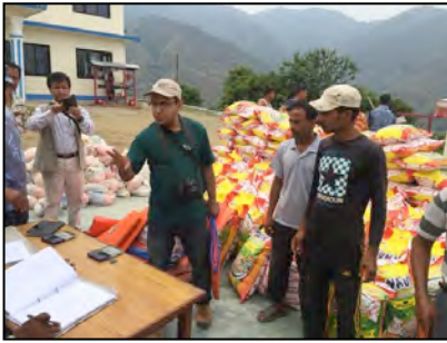
LWR and partners work to coordinate a food distribution to people in the remote village of

Thank you to the Prince of Peacers who have contributed money for earthquake relief in Nepal.